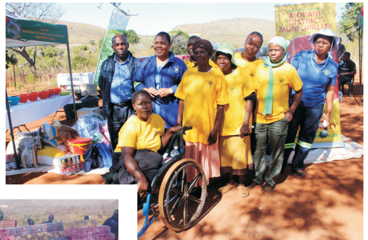
MDM staff members on a cleaning campaign at Pfunanani Special School.