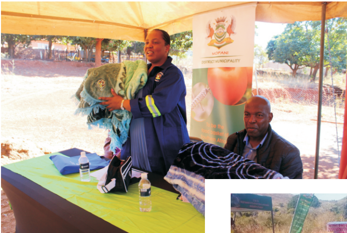
Goodies that have been handed over to the Seshego Dissability Centre by the Executive Mayor Cllr Nkakareng Rakgoale.

"The Nelson Mandela International Day calls for everyone across the globe, to stand up and make a difference, change the lives of others by giving a hand in spending at least 67 minutes to improve the lives of other people in the society. We will also engage the relevant departments to also come on board as you can see that the family needs a house and other basic amenities." Said Rakgoale. The Mandela International Day activities were also taken to Ballon village in the Maruleng Municipality where the Seshego Disability Centre received groceries and other basic amenities. The Executive Mayor Rakgoale pleaded with businesses and other stakeholders to also come on board and assist canterers such as Seshego to create a conducive living conditions for the people who are being taken care off there.