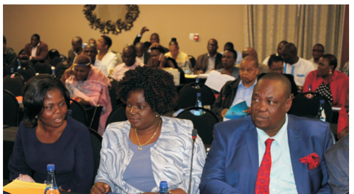
The Mayor of Maruleng Municipality, Councillor Dipuo Thobejane, the Mayor of Greater Giyani Municipality, Councillor Sasavona Mathebula and the Mayor of Greater Letaba Municipality, Councillor Peter Matlou at the IGR forum