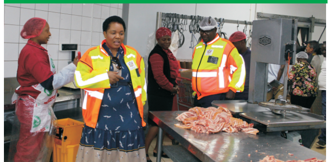
The Executive Mayor Cllr Nkakareng Rakgoale joins the Environmental Health Practitioners in checking compliance at one of the shops, during a Blitz operation aimed at removing expired food stuffs from the shelves.