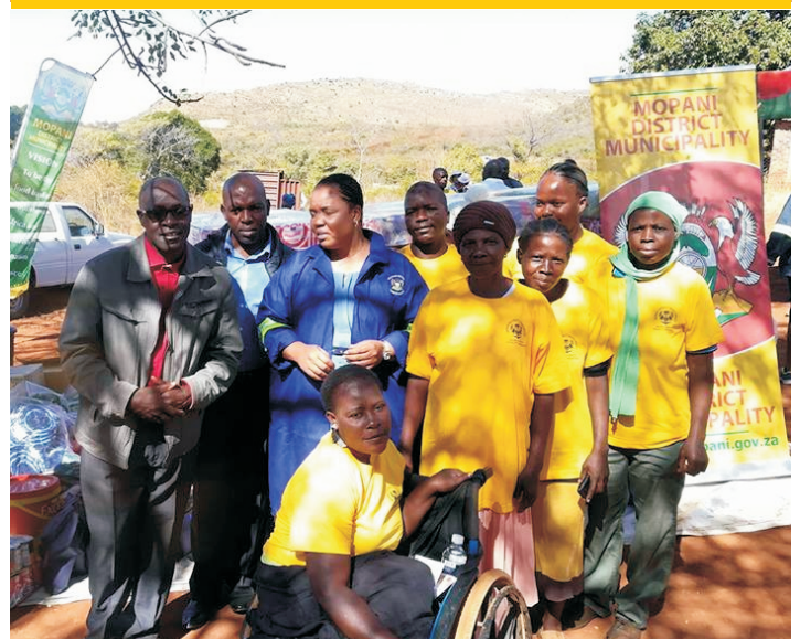
The Executive Mayor Cllr Nkakareng Rakgoale with some of the beneficiaries at Seshego Disability Centre in Ballon village in Maruleng.