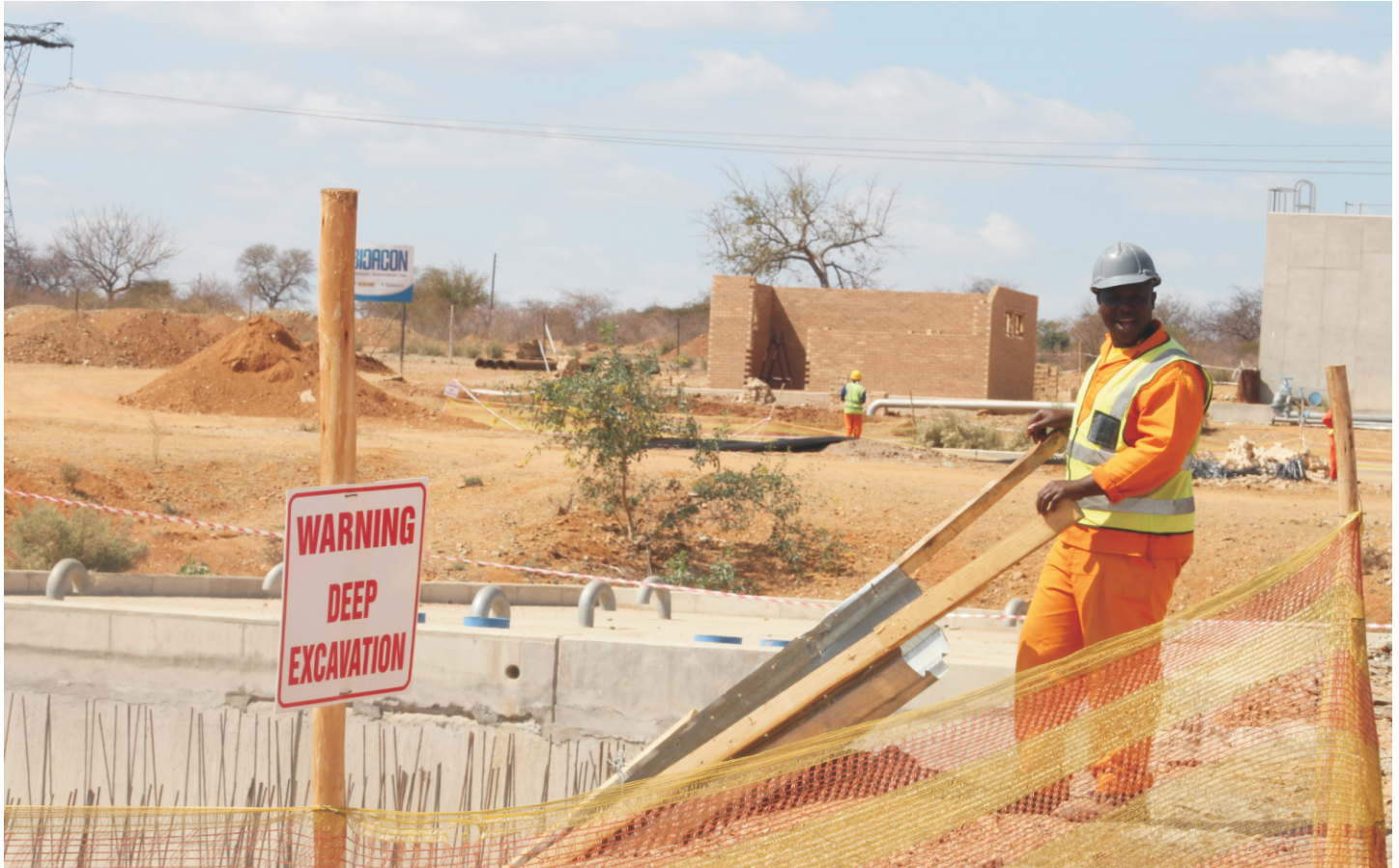
A construction worker hard at work at the Mametja-Sekororo Water Purification Plant outside Hoedspruit.

T he residents of about 15 villages in the Mametja-Sekororo areas in the Maruleng Municipality outside Houdspruit will soon get running water. This as the completion of the construction of a water treatment plant at The Oaks is at an advance stage. Residents of The Oaks, Finale, Turkey, Santeng and Madeira among others will benefit from the first phase of the project. A total of 28 villages will get water in the area when all phases of the project are fully completed.