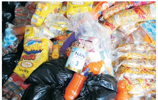
Food stuffs that have been removed from the shelves at some of the shops in Giyani, during a Food Safety Blitz operation held across the Mopani District Municipality.

are here to check what is happening as we are accompanied by our health practitioners we want to check as to what kind of food is being sold to our people, as you can see some of the meat we have found here is rotten and it can't be, we are not fighting with them but we just want our communities to get value for money as they buy products from these shops." Said the Executive Mayor Rakgoale.