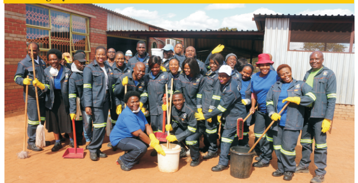
MDM staff members on a cleaning campaign at Pfunanani Special School during the Mandela Day Celebrations.