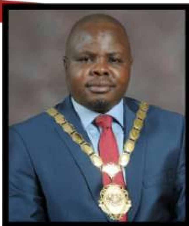
Cllr Pule Shayi Executive Mayor