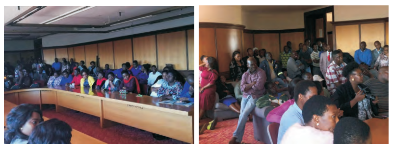
Employees attentively listening to the Executive Mayor during the meet and greet session