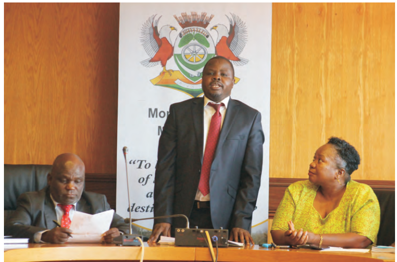
• The new Executive Mayor Cllr Pule Shayi addressing employees during a meet and session.

The staff members cheered in acknowledging and accepting the welcome address by the Executive Mayor Cllr Shayi. The Executive Mayor Shayi also urged all employees to go the extra mile in serving the people of Mopani District Municipality. The Municipal Manager, Directors and managers also attended the session. Municipal Manager Republic Monakedi says the employees are delighted to have someone of Shayi's calibre leading the institution.