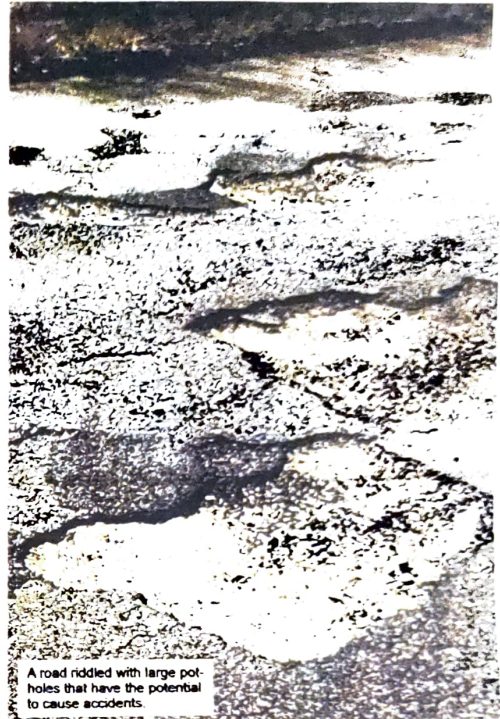
A road riddled with large potholes that have the potential to cause accidents.