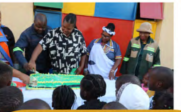
HANDOVER OF EQUIPMENT - KHAMANGU EARLY LEARNING CENTRE